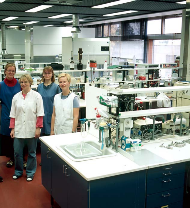
Laboratory for industry and power plant chemistry